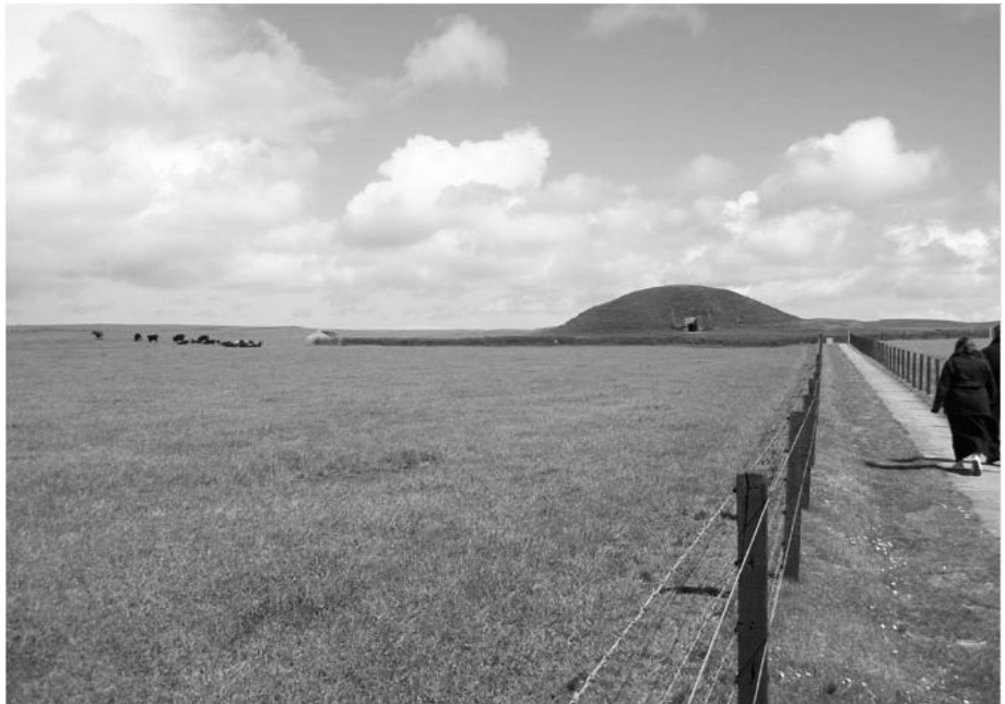
Maeshowe, Orkney, Scotland

This year, the Winter Solstice is on December 22, at 6:09 am Greenwich mean time or December 21,