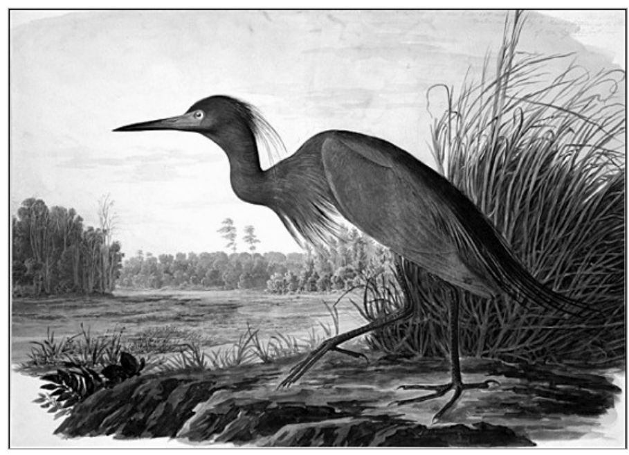
Heron - Audubon